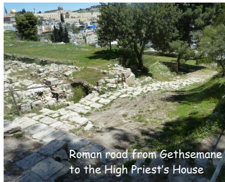
Roman road from Gethsemane to the High Priest's House

Finally to Jerusalem and a day in which we journeyed from the Mount of Olives via the Garden of Gethsemane to the Church of St Peter in Galllicantu (meaning cockcrow), built over the site of the High Priest's residence. Ancient olive trees in Gethsemane have been confirmed as being over 2,000 years old, and the sense of Jesus having prayed among them was both distressing and strangely comforting. A Roman road from here to the High Priest's residence is almost certainly the route taken by Jesus and his captors on the night before his crucifixion; and the stone cell below the modern church is highly likely to be the place where Jesus was kept