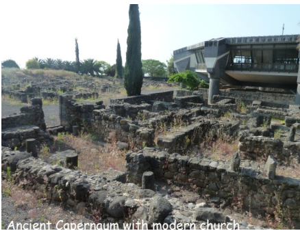
Ancient Capernaum with modern church

The excavated remains of first century Capernaum exerted a particularly powerful pull on my soul and I spent many minutes simply rooted to the spot contemplating Jesus' activities there, in the company of Peter's family, after he had been banished from Nazareth. The newly built church on