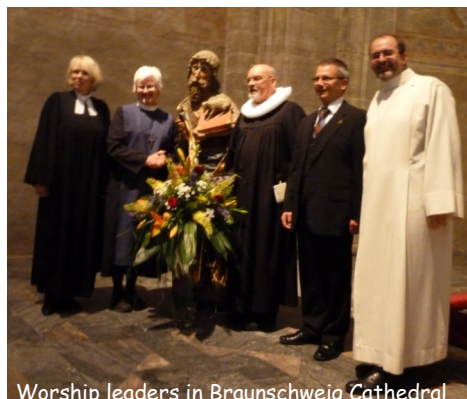
Worship leaders in Braunschweig Cathedral